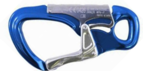
BLUE TANGO 71500BPX2KK