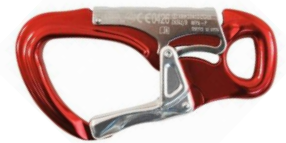
RED TANGO 71500RPX2KK